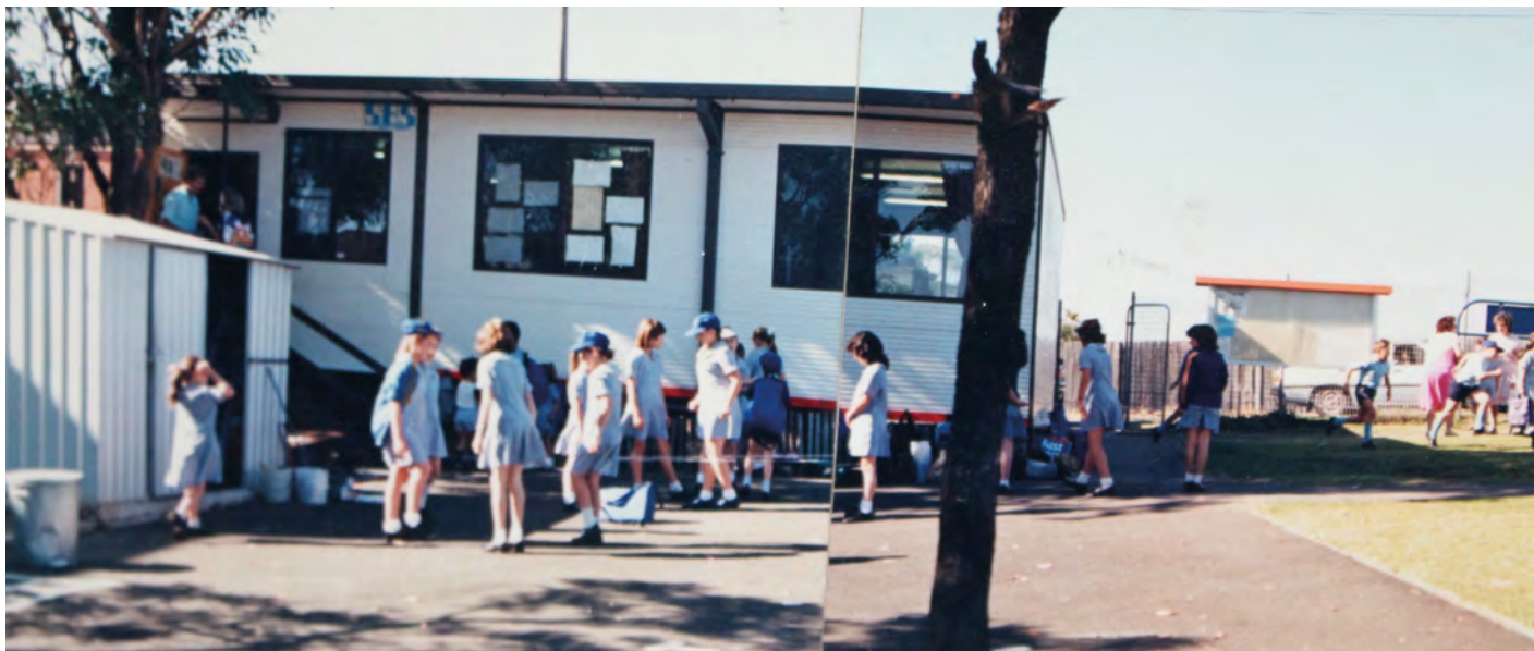
Playground circa 1985