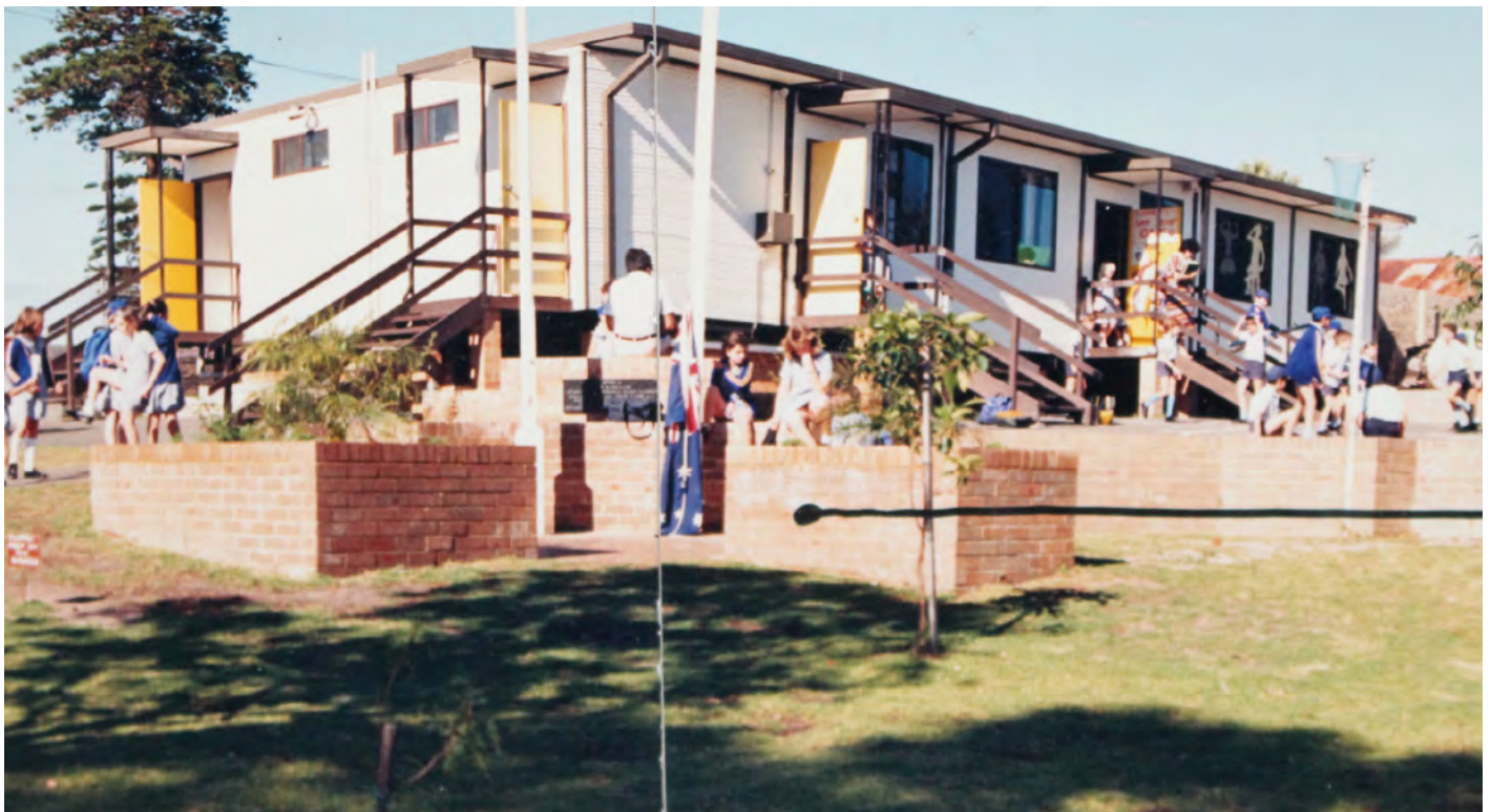
Demountable classrooms circa 1985

The College commenced in the rear of Maroubra Synagogue in 1981 and was then housed in demountable classrooms until the construction of our first school building in 1993, followed by an additional building in 2009, both based on a post-industrial concept of schooling.