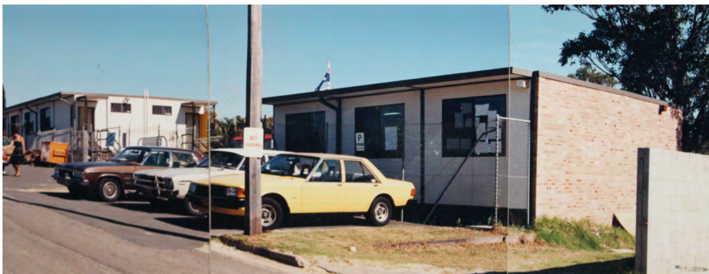
Runic Lane circa 1985

A successful Capital Appeal will enable the creation of flexible, versatile, innovative and collaborative learning spaces to complement the curriculum and prepare students as future leaders, equipping them appropriately for the workplace that awaits them.